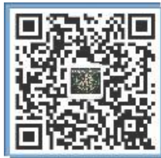
WeChat QR Code